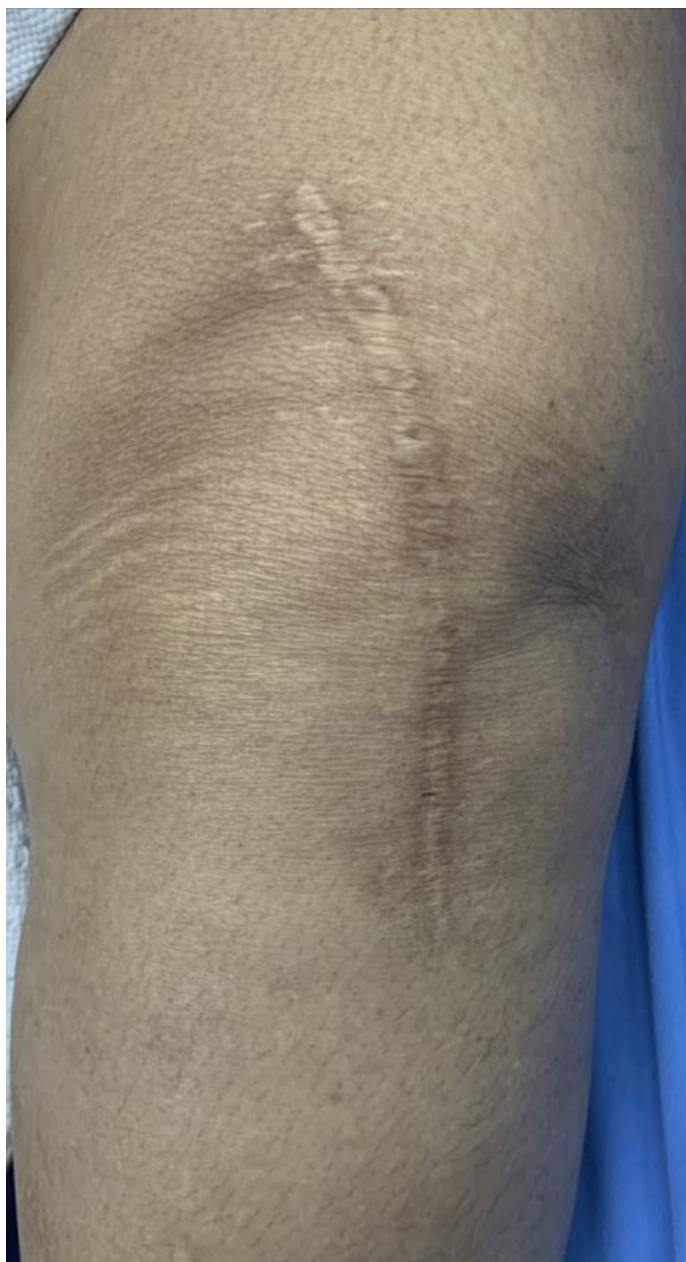
Fig. (4). Picture of a patient who underwent Total knee arthroplasty 14 months ago who had standard skin care post surgery.