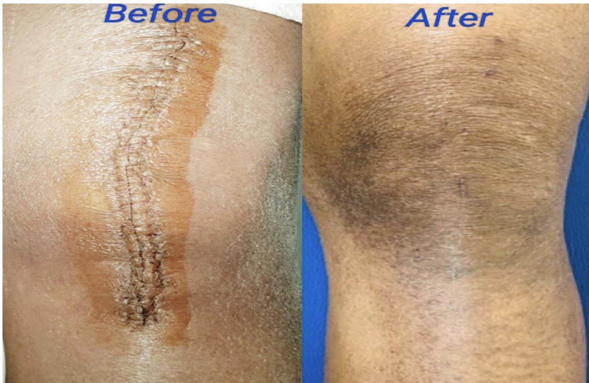
Fig. (2). Clinical Picture 14 days after surgery with removal of clips and after 2 months of using JASC.