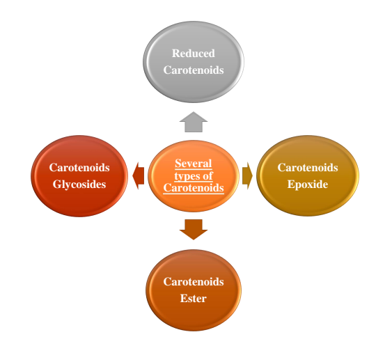
Fig. (3). Carotenoid derivatives.